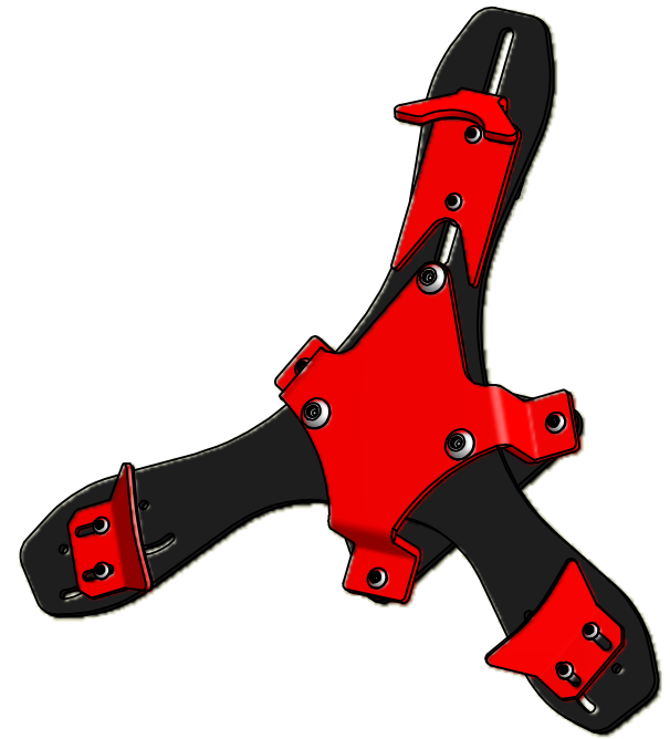
Talon Mounting Bracket